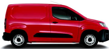
CITROËN BERLINGO VAN

Whether it's scooting around the city or cruising up the motorway, lugging pallets or delivering a bunch of flowers you'll find a Citroën van to meet your needs.