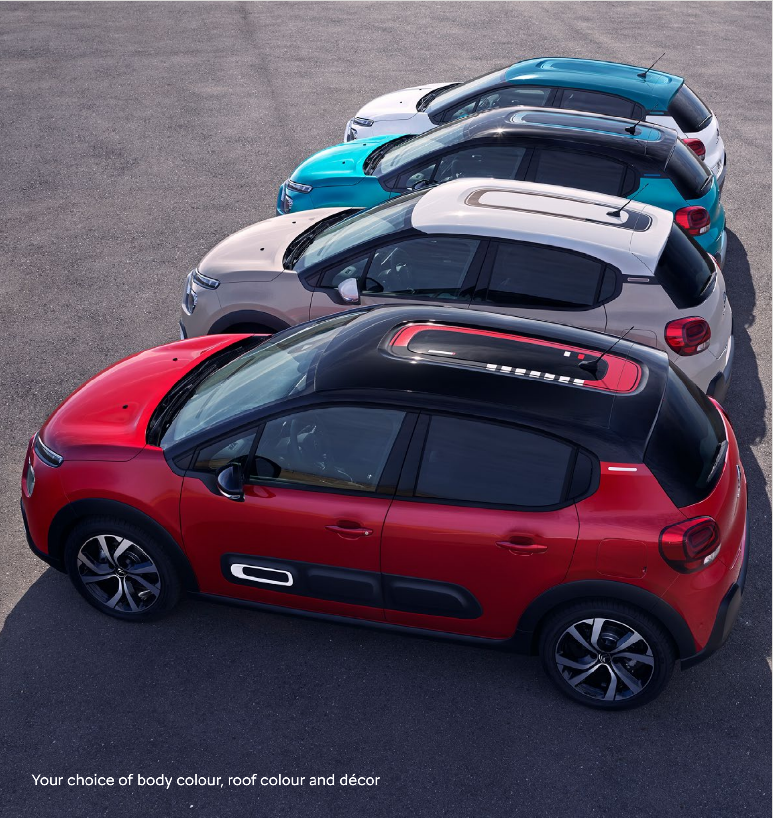
Your choice of body colour, roof colour and décor