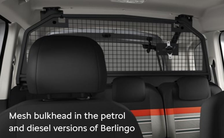
Mesh bulkhead in the petrol and diesel versions of Berlingo

Please note, petrol and diesel versions of Berlingo are homologated as 'N1' (light goods vehicle under 3.5 tonnes) due to having a mesh bulkhead behind the second row of seats, and therefore subject to Vehicle Excise Duty and UK speed limits applicable to light goods vehicles. The petrol and diesel versions may also attract the higher light goods vehicle toll road charges where applicable.