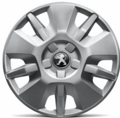
335 Panel Vans