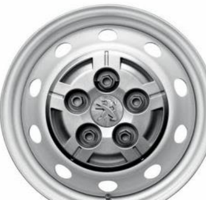
440 Panel & Window Vans