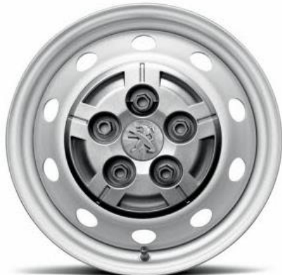
335 Panel Vans