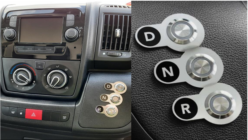
Gear Lever replaced with Drive Mode select buttons located to the left of the steering wheel