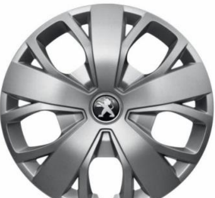
440 Panel & Window Vans