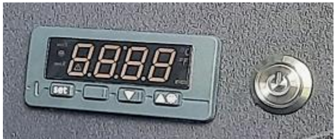
Secondary heating control panel is included to the right of the steering wheel.