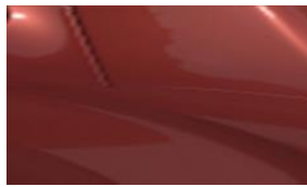
AMBER RED (M)