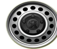
16 inch steel wheel with black centre cap