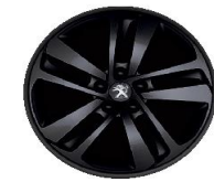
17 inch black Phoenix alloy wheel Available as standard on Sport Edition only