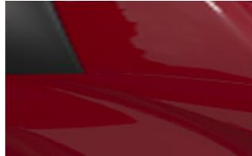
ARDENT RED (F)