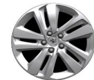
17 inch 'Phoenix' alloy wheel Standard on Asphalt