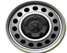
17 inch steel wheel with black centre cap