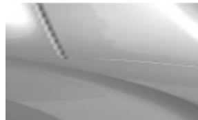
CUMULUS GREY (M)