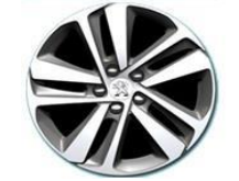
17 inch two-tone 'Phoenix' alloy wheel Option on Professional and Asphalt