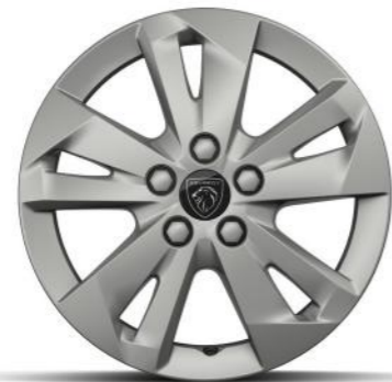
Optional Alloy wheels available via Style Pack